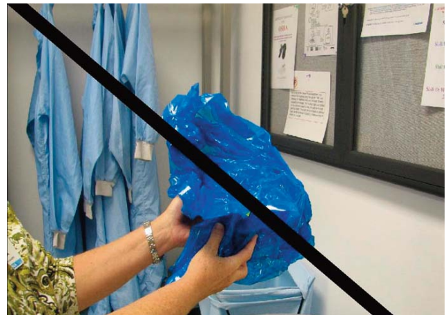
Blue tack mats no longer required