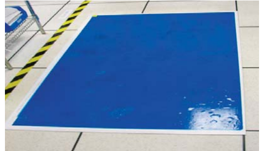
One blue tack mat being used in the changing area.

A major Medical Device Manufacturer operating in Hybrid Manufacturing areas has evaluated the polymeric floor coverings in comparison to the tack mats that were previously being used. Various consumables are used in the facilities gowning room including bouffants, face masks, garments, ESD shoes, and gloves. Blue tack mats were used to capture dirt from operatives "street shoes" as they entered the gowning room. The building where tests were conducted spent $24,000 on tack mats per annum. This building disposed of approximately one ton (2028 lbs) of used plastic peel off mat sheets in the trash per annum.